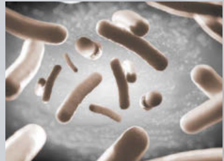
surface without HyperClean