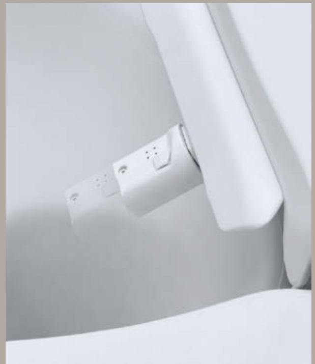
Adjustable shower arm position.

your ideal spray position. Adapt the exact spray arm position for great performance every time.