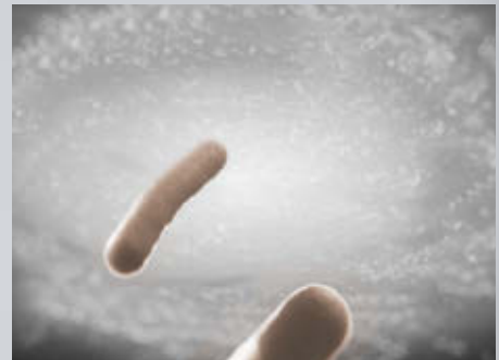
surface with HyperClean