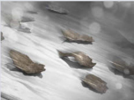
surface with AquaCeramic