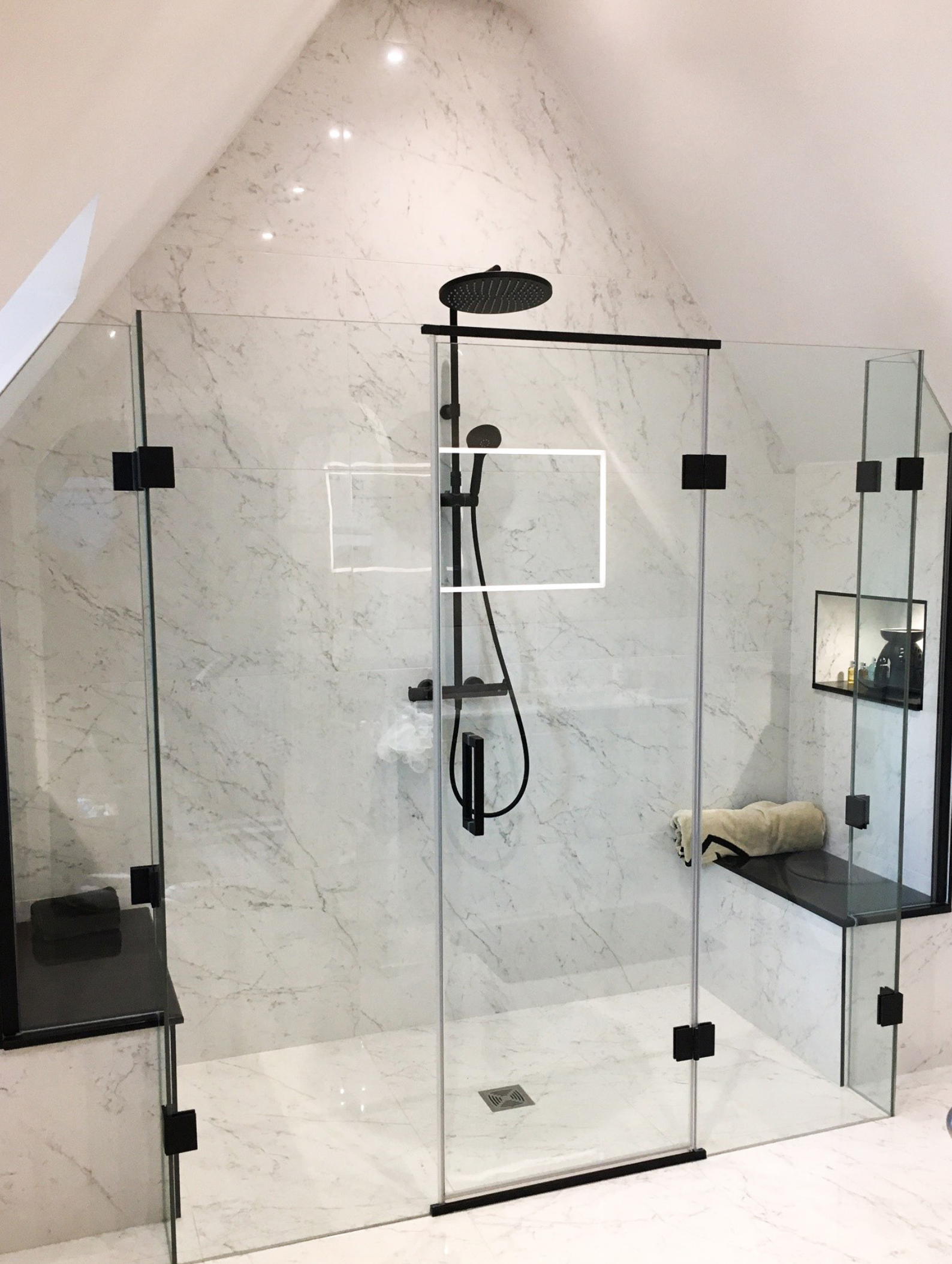
DS476 - Bespoke matt black with clear glass